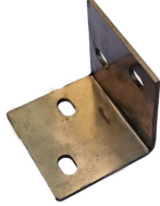
L shape connector × 8PCS