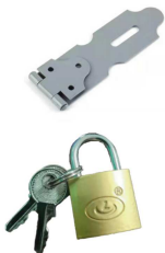
Lock × 1PCS